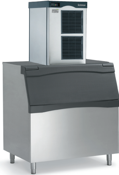
Shown on B948S bin with optional KLP8S legs.